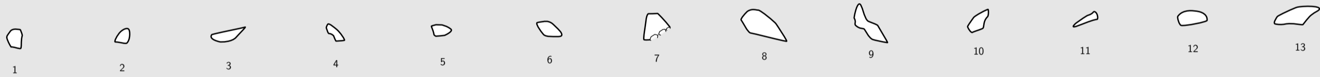
Cross-sections at the same scale as the plan and elevation.